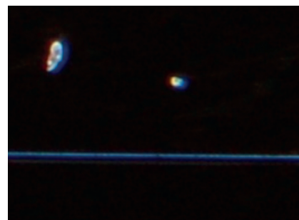
Figure 3b When light source is perpendicular to the scratch, the scratch becomes visible.

rock or sandpaper can be used to create observable scratches.